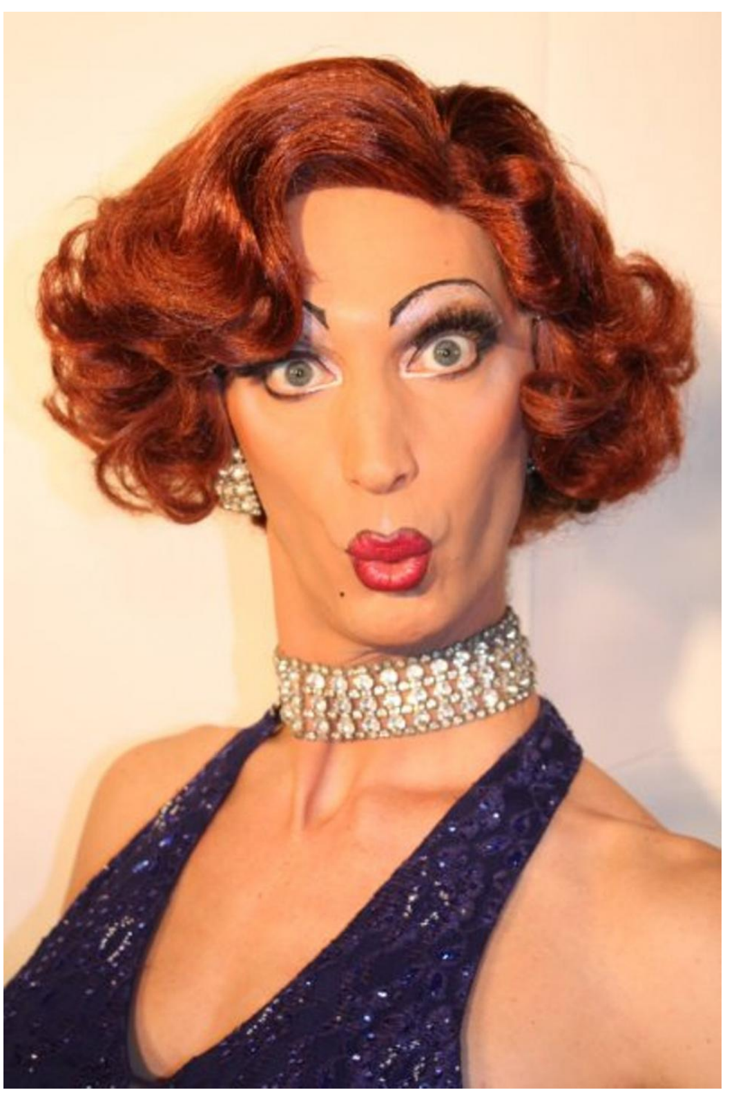
Brighton drag queen jailed for planning sex session