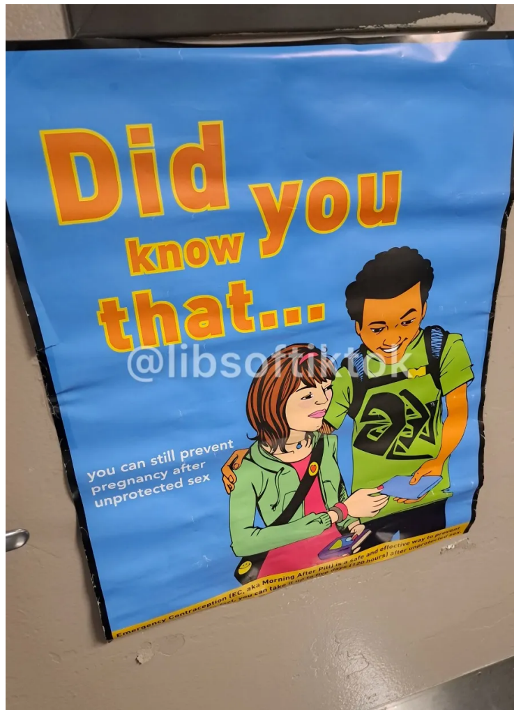
CATCH Program flyer in Forrest Hills High School, Brooklyn, NY

New York City's Department of Education has been providing birth control (such as the long-lasting shot Depo-Provera), Plan B/emergency contraception, and "all pregnancy options" to thousands of high school students in grades 9-12, without parental consent or notification through the Connecting Adolescents To Comprehensive Health (CATCH) program .