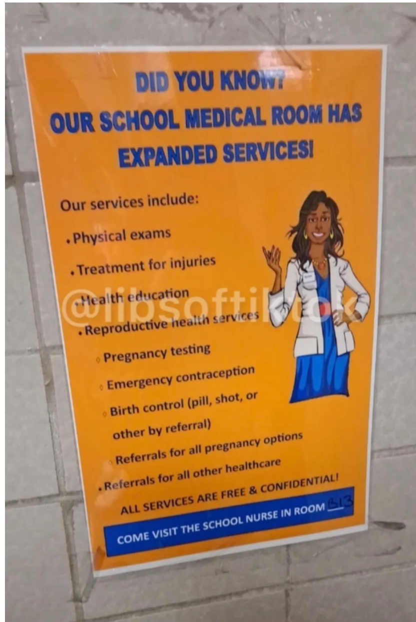
CATCH Program Flyer in Forrest Hills High School, Brooklyn, NY

We reached out to New York's Department of Health to see how many students received birth control, the morning-after pill, and two different medications referred to as the "abortion pill": mifepristone and misoprostol. We have yet to receive a response, but if the numbers from the pilot remained consistent we are looking at well over 15,000 students receiving Plan B, and over 16,000 receiving birth control pills without parental notification. Despite other data showing a majority of parents opposed the program, health officials say only one to two percent of parents in those schools chose to opt out of the program.