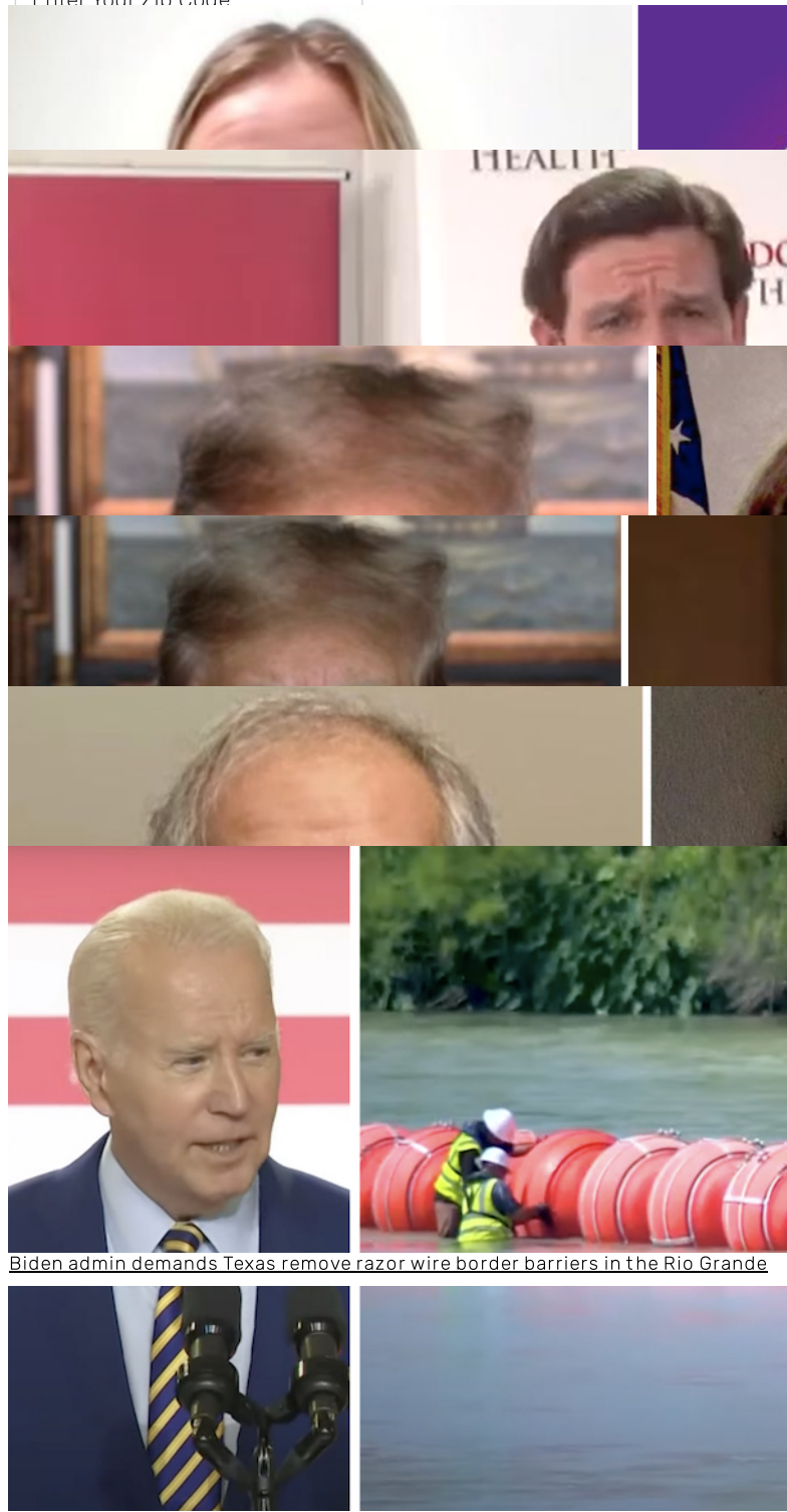
Biden admin demands Texas remove razor wire border barriers in the Rio Grande