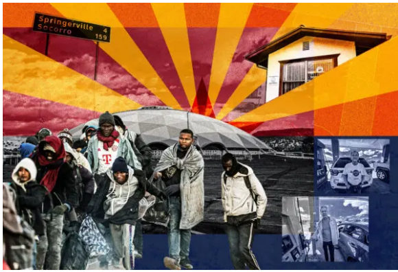
A Small Arizona Town Prepares to Fight State Over Illegal Immigration