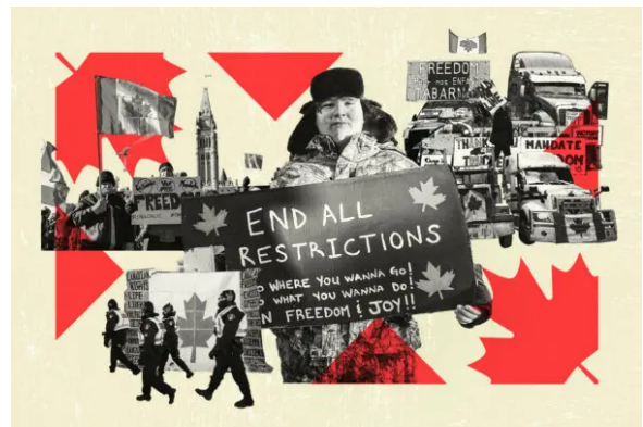
After Court Victory for Freedom Convoy, Canadians Ready to Sue