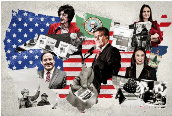
How Secretary of State Races Became Key Focus in Election Integrity Battle