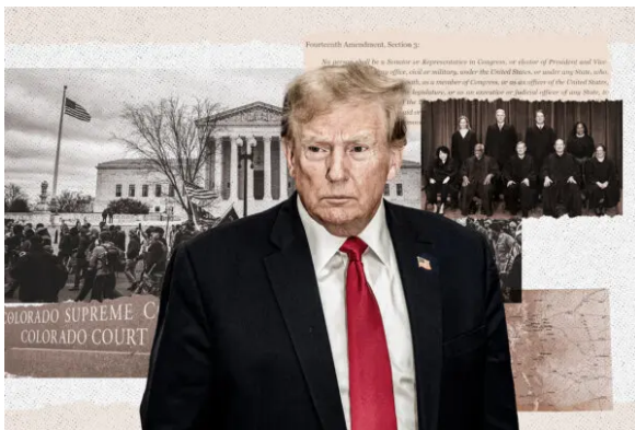
The 4 Directions Supreme Court Could Go in Trump Ballot Case