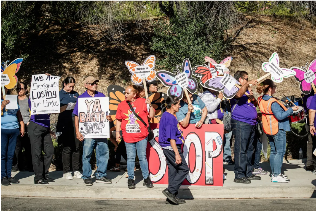
Members of CHIRLA Action Fund, an immigrant advocacy organization, gather near the entrance to the Ronald Reagan Library prior to a GOP presidential debate in Simi Valley, Calif., on Sept. 27, 2023.

Others believe that Democrats want open borders because if illegal immigrants become citizens, they would likely vote to keep Democrats in power for generations.