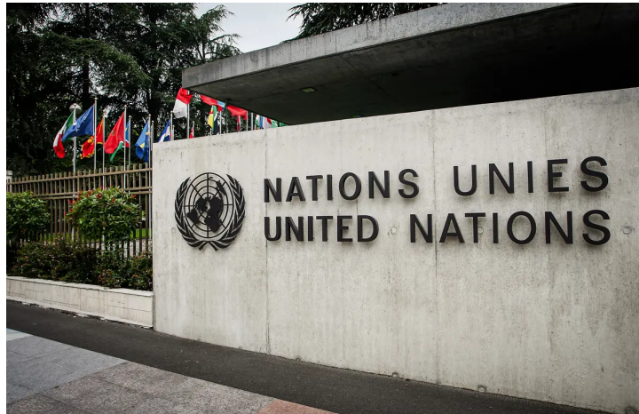
The United Nations office in Geneva, Switzerland, in this file photo. The Biden administration gave the U.N.'s migration agency nearly $1.3 billion in 2023.