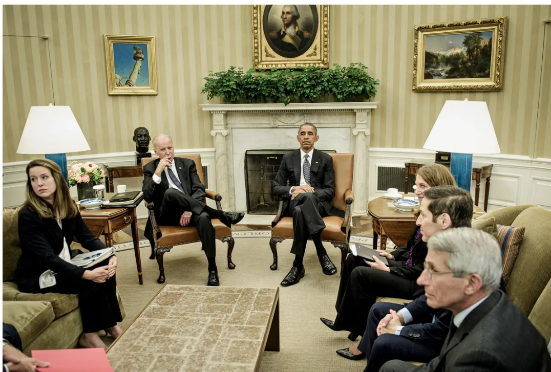
(L-R) Amy Pope, deputy Homeland Security advisor, Vice President Joe Biden, President Barack Obama, and other officials meet in the Oval Office on May 21, 2016.

IOM Director General Amy Pope served as President Biden’s senior adviser on migration. She also served as deputy Homeland Security adviser to President Barack Obama.