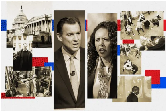
Impact of Illegal Immigration Gets Tested in New York Special Election