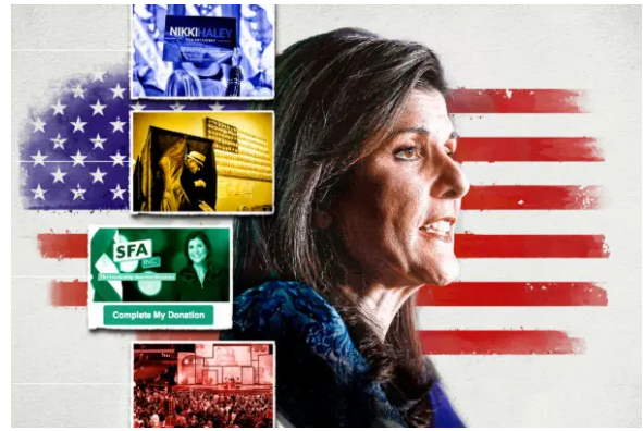
'Never Trump' Billionaires Lead Nikki Haley's 2023 Fundraising