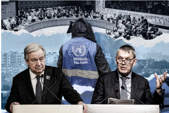
Critics Blast UN for Ignoring Longstanding Ties Between UNRWA and Hamas