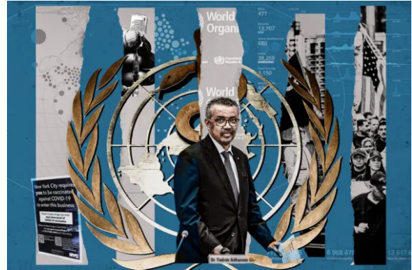
As WHO Pandemic Treaty Nears Completion, Critics Raise Red Flags for US Freedoms