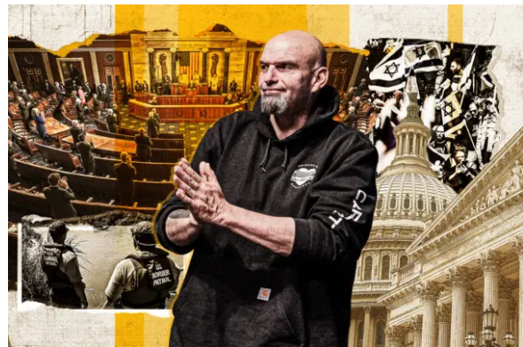
John Fetterman Is Not the Progressive Politician Everyone Thought He Was