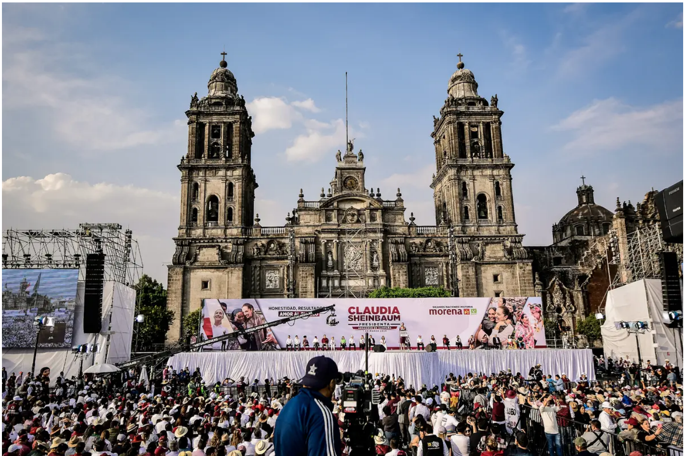
The presidential campaign launch event of Claudia Sheinbaum at Zocalo Square in Mexico City, Mexico, on March 1, 2024.

He said he believes that the current mass migration is laying the groundwork for the next stage, which will be partly dependent on who wins the Mexican presidential election in June and the U.S. presidency in November.