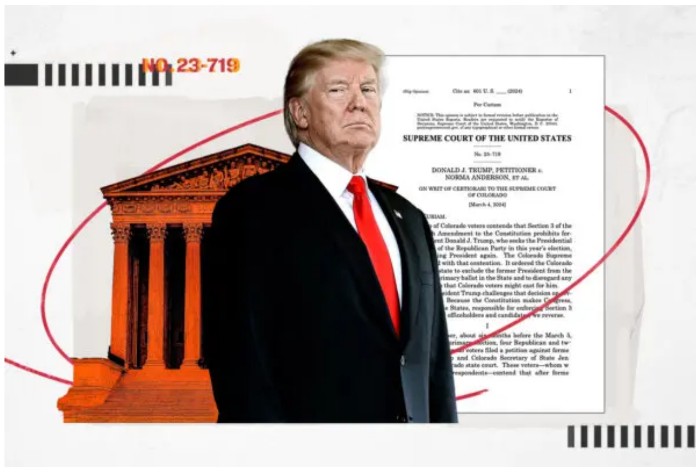
Key Takeaways From Supreme Court Trump Ballot Ruling