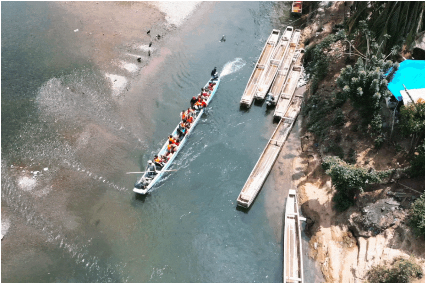
A canoe operated by the Embera arrives at Bajo Chiquito in Panama on Feb. 18, 2024. The town is a transit point for migrants arriving from the Darién jungle and moving farther into Panama.

In February, The Epoch Times visited all four migrant camps in Panama: Lajas Blancas, Bajo Chiquito, San Vicente, and Canaán Membrillo.