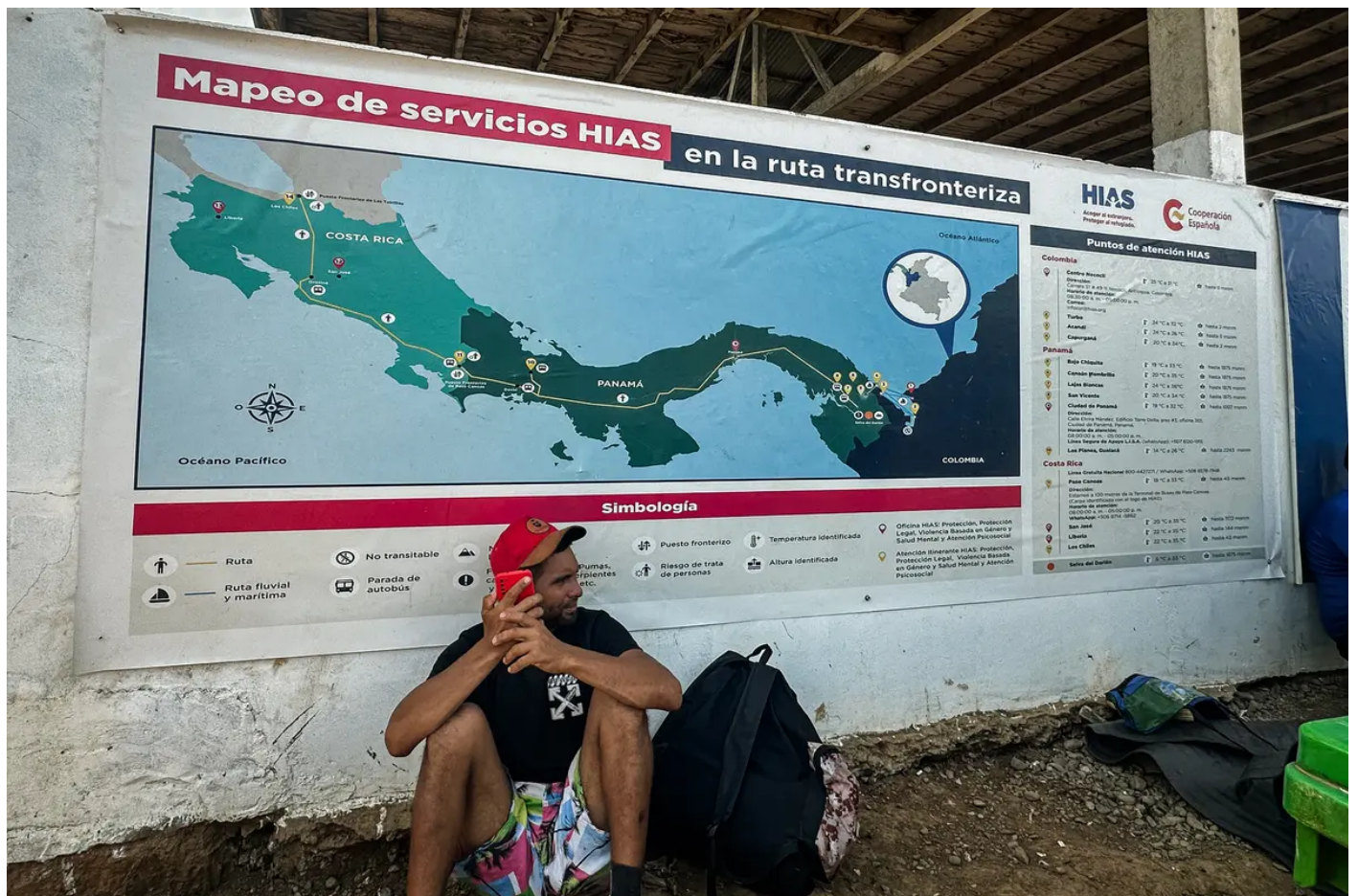
A migrant sits under a detailed migration map provided by a non-government organization at a migrant camp in the Darien Gap, Panama, on Feb. 18, 2024.

One HIAS map shows the migration route from Colombia to Costa Rica, including detailed bus stops, temperatures, altitudes, and “migration kiosk” locations.