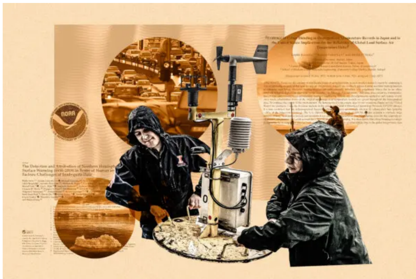
Scientists Expose Major Problems With Climate Change Data