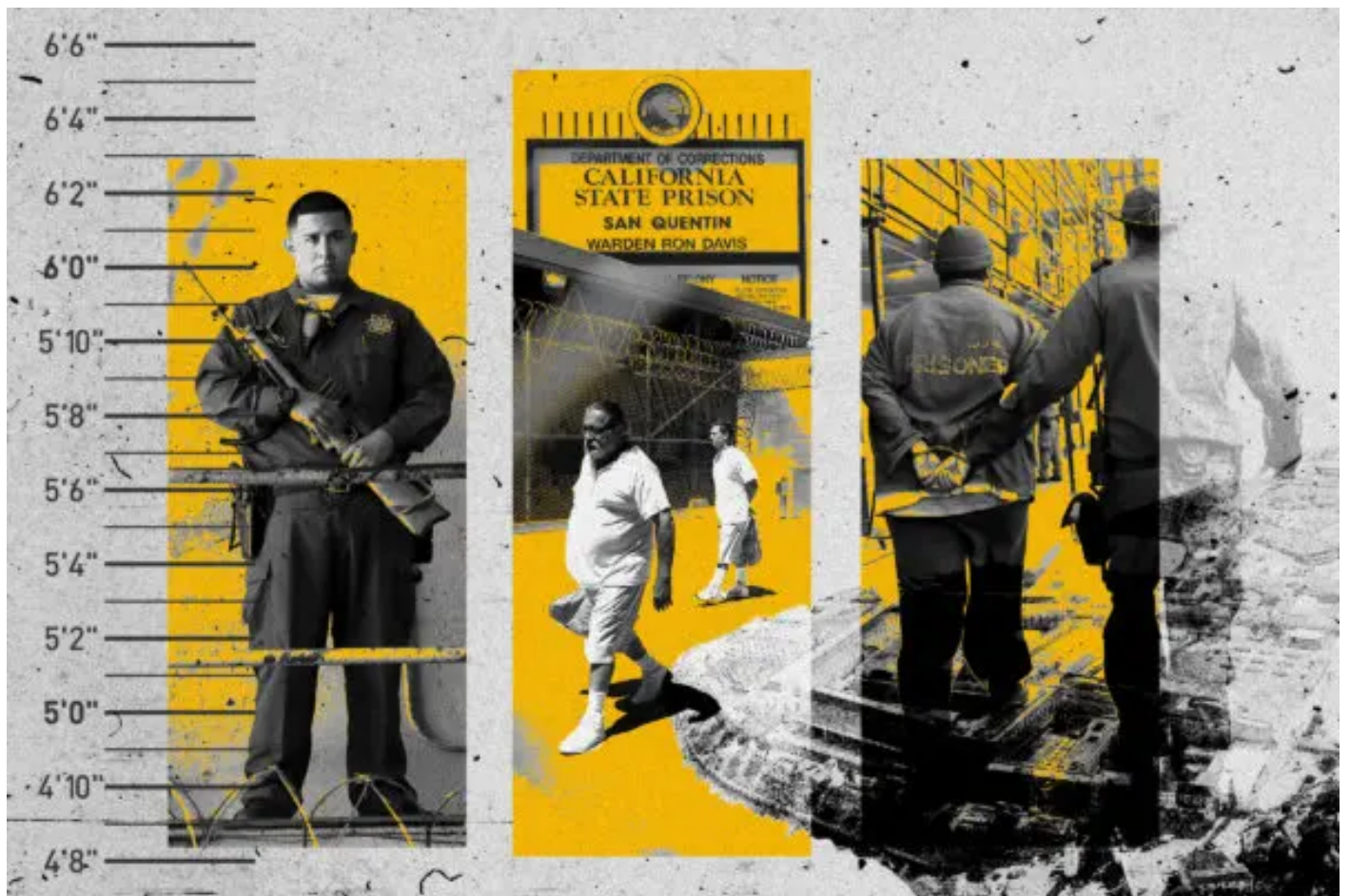
California Transformed Prisons to the 'Norway Model,' Insiders Reveal the Deadly Cost