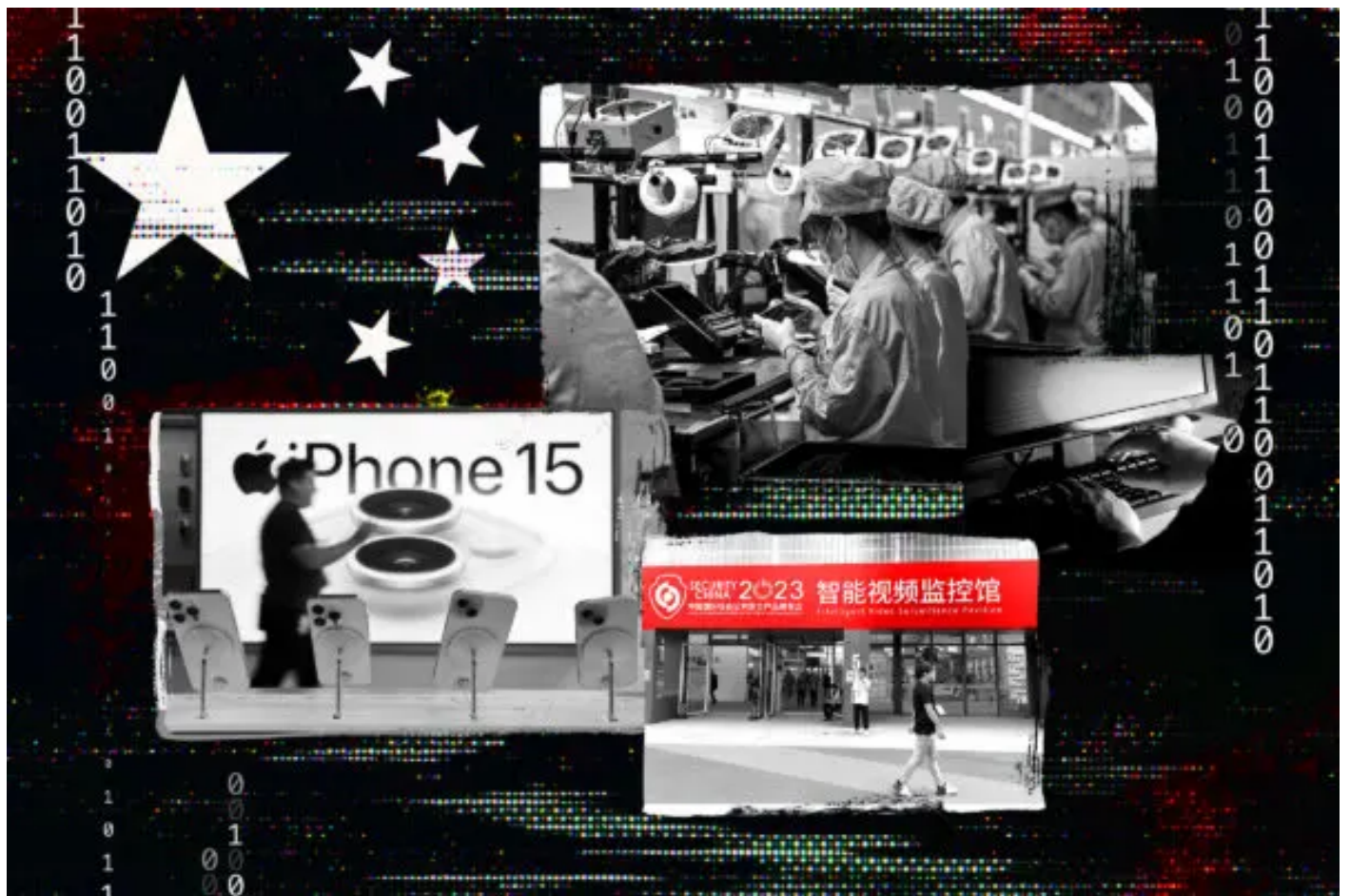
Leaked Hacking Files Spur Concerns of China Weakening US for War