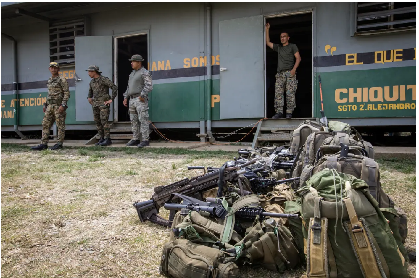
Panama's SENAFRONT border police stage their equipment outside their barracks in Bajo Chiquito, Panama, on Feb. 18, 2024, as they prepare for a deployment in the Darien Gap.

But Texas is facing its own issues from the border crisis. Aside from being on the front line of the influx, the federal government has lodged several lawsuits against Texas for its actions to secure its border.