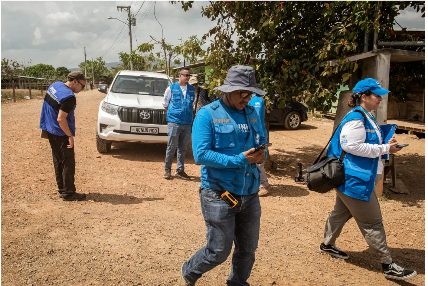
U.N. refugee agency personnel arrive at the San Vicente migrant camp in the Darien Gap, Panama, on Feb. 20, 2024.

Others said they were stranded at the camps because they were robbed during their journey or couldn't pay the $60 needed for the bus ride north.