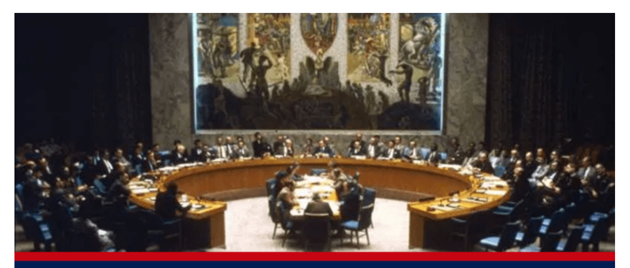
1991 document describes what constitutes the New World Order; all nations will be given "quotas for population reduction on a yearly basis"

Featured image: Meeting of the United Nations Security Council.