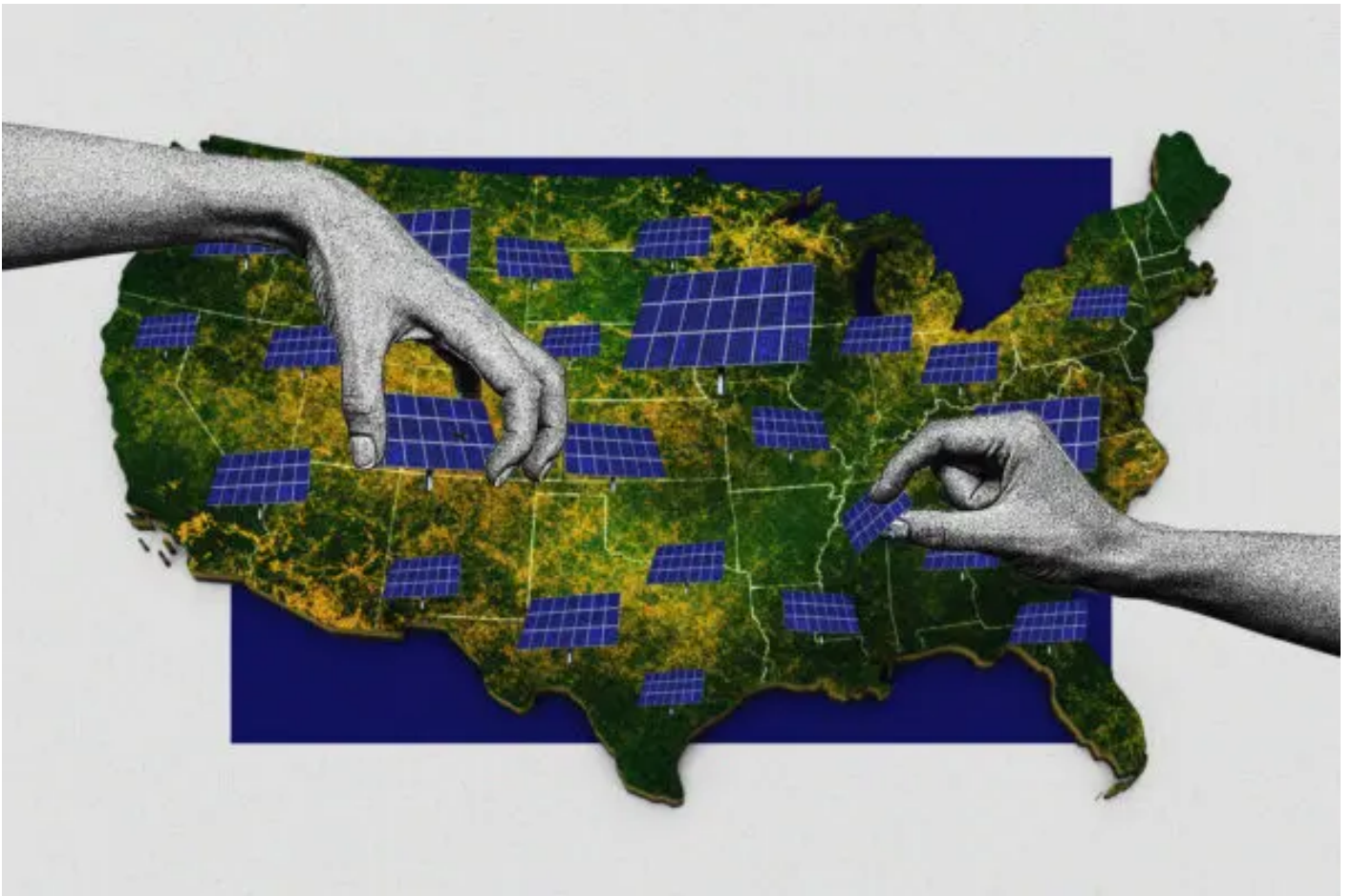
Rural America Set to Be Transformed by up to 55 Million-Acre Federal Solar Plan