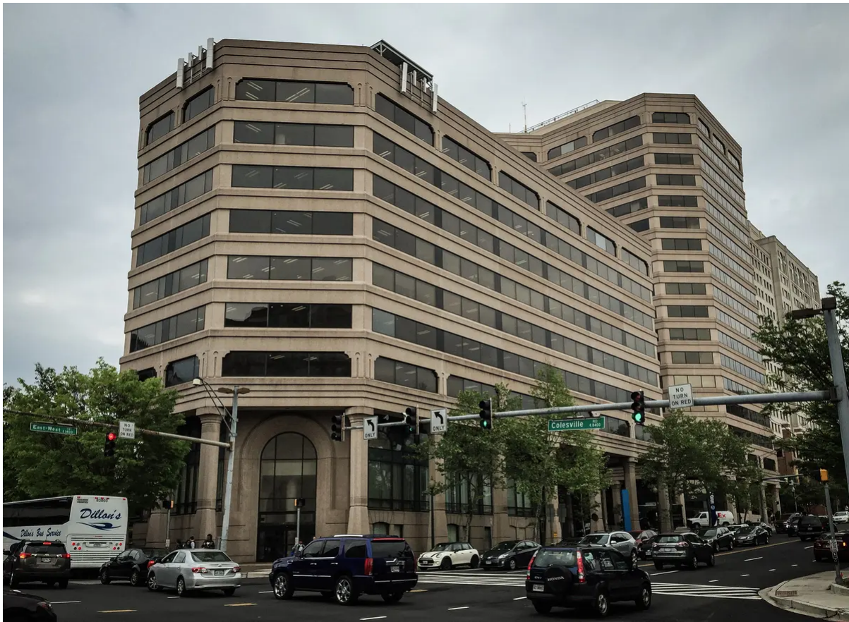
National Oceanic and Atmospheric Administration headquarters in Silver Spring, Md.