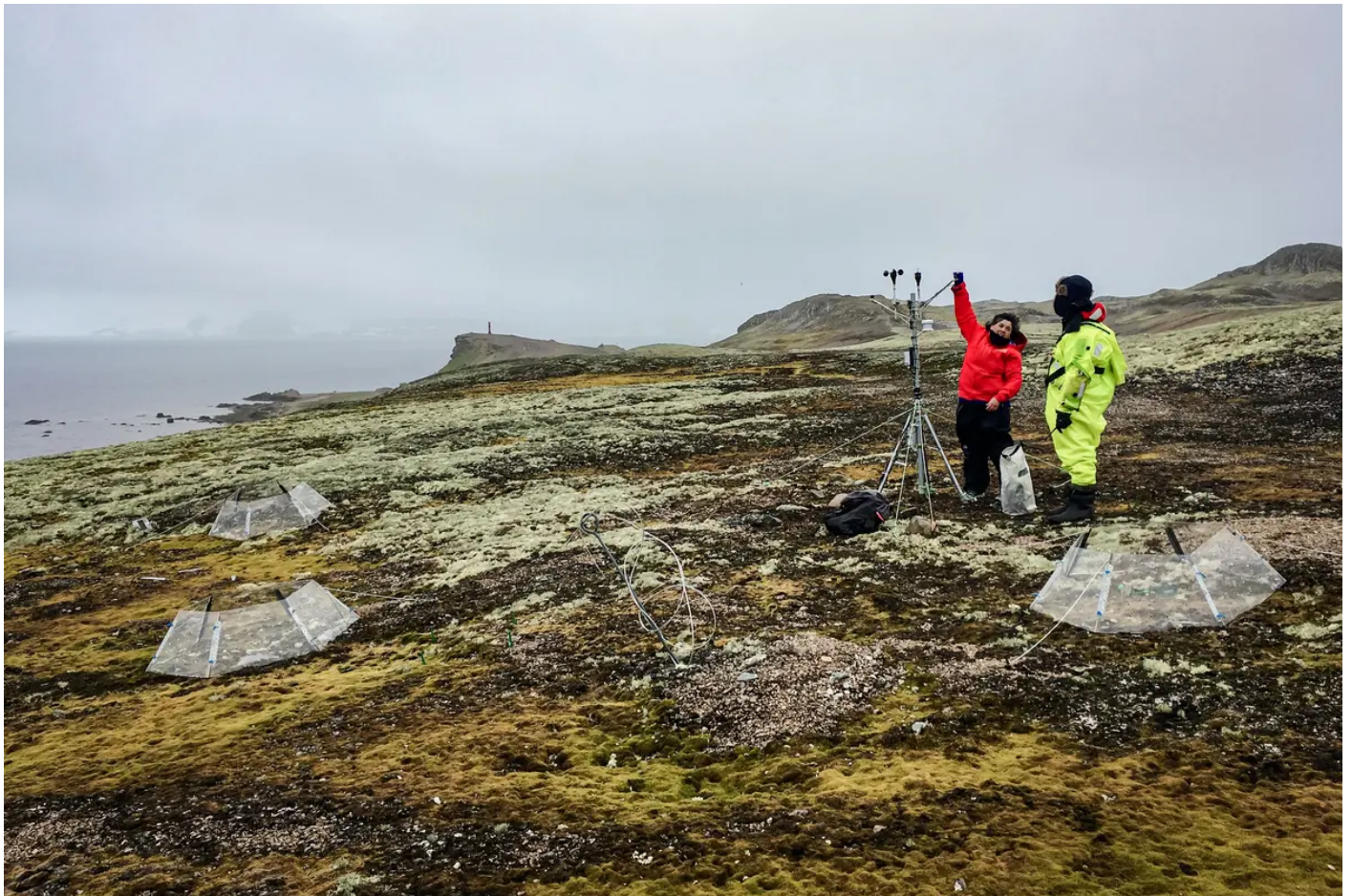
Scientists use a weather station to study global warming, on King George Island, Antarctica, on Feb. 3, 2018.

But the CERES scientists' "contention that the warming inferences we are making are bunk because of the gauge changes and station relocation issues, and their suboptimal handling in homogenization procedures, are just not true," he said.