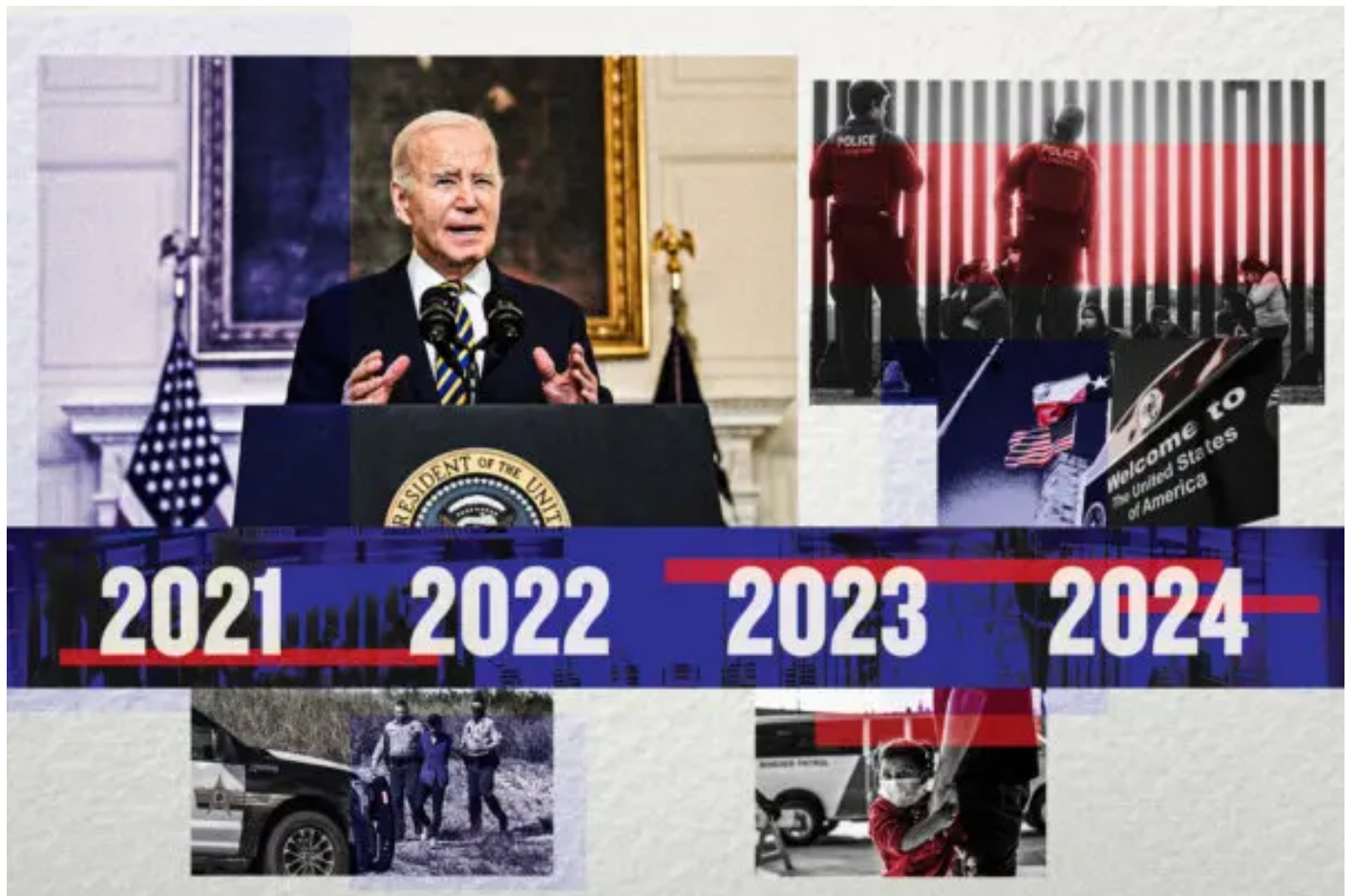
The Biden Policies That Transformed America's Borders