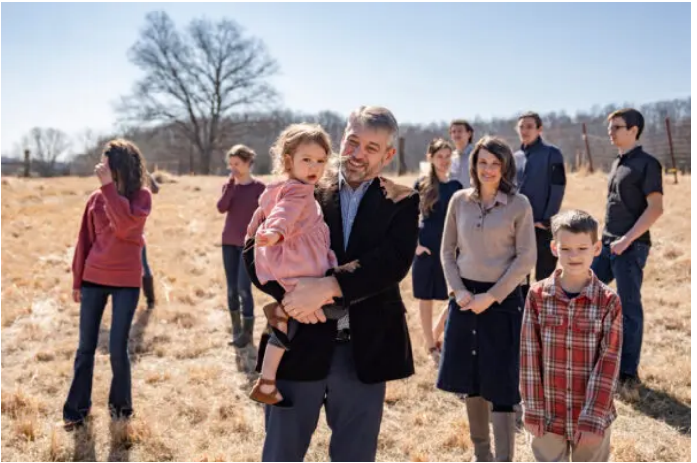
Americans Face Decades in Prison for Convincing Women Not to Have Abortions