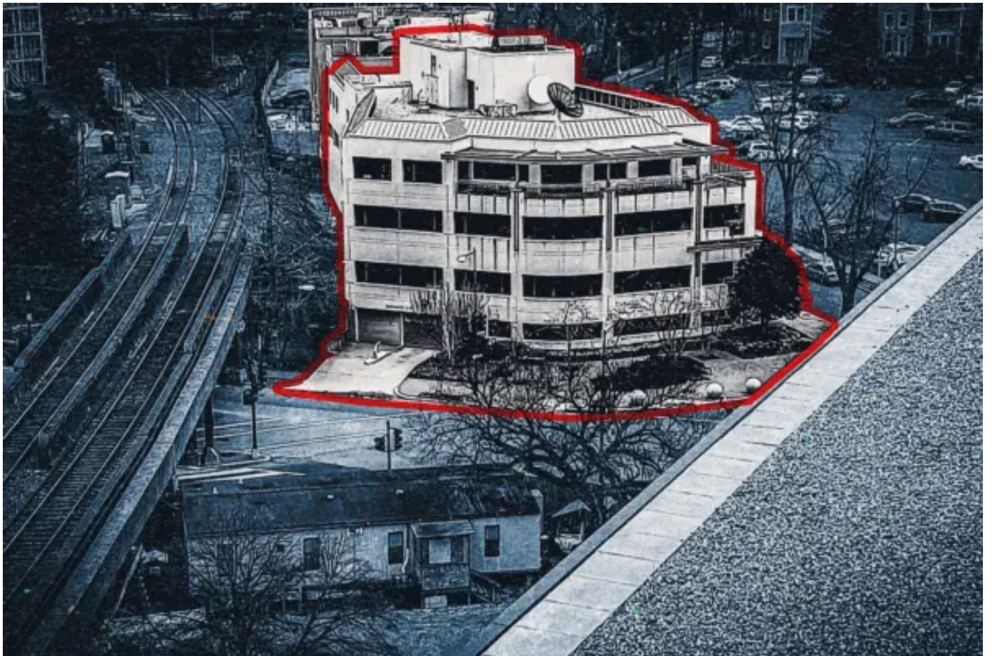
3rd Pipe Bomb Camera Deliberately Turned Away From Scene