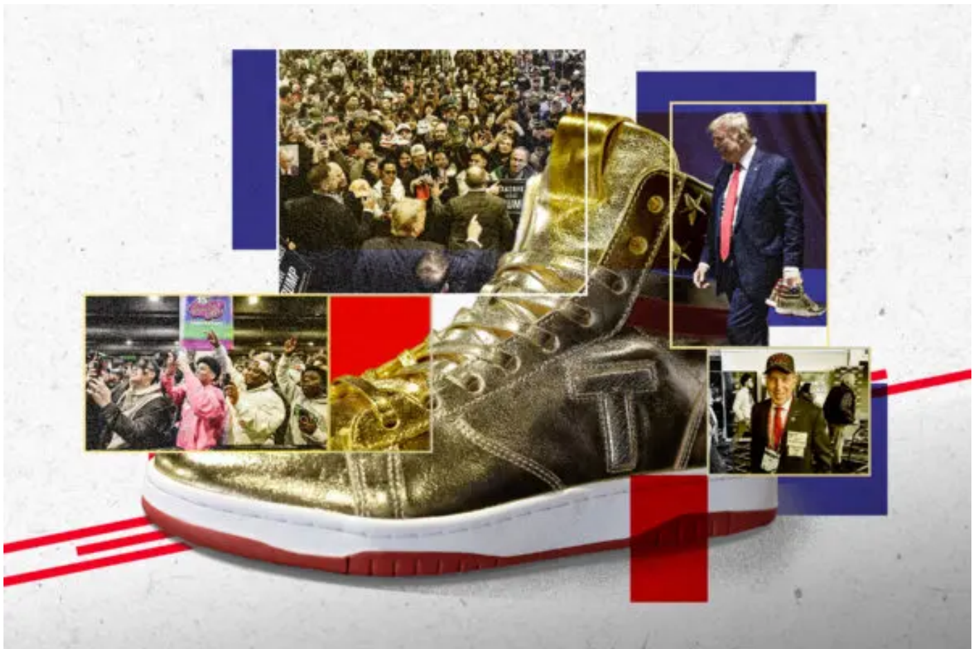
Trump Is Finding New Ways to Disrupt the Political Game, and His Supporters Love It