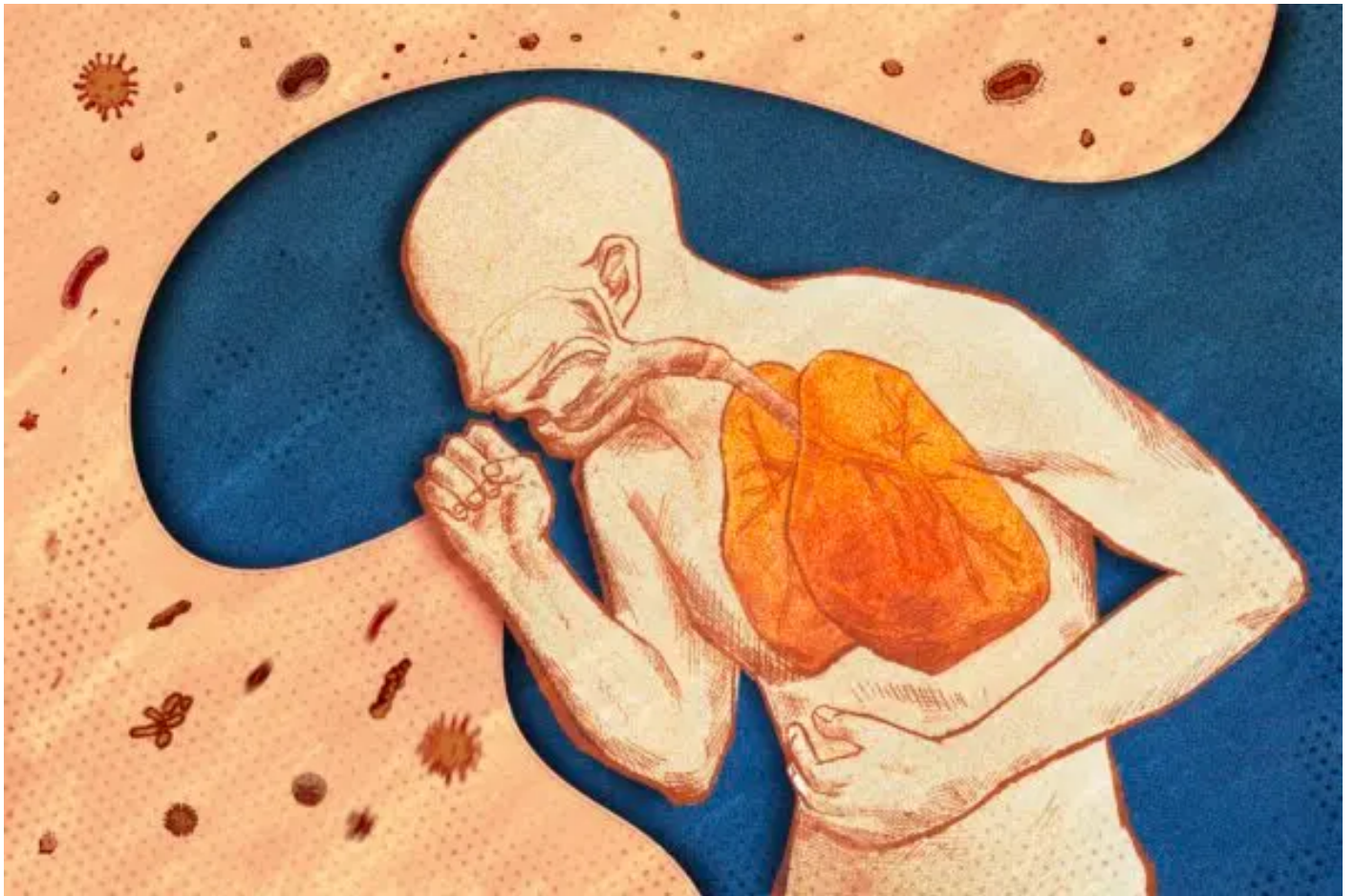
The Real Causes Behind Coughing, and How to Get Rid of It