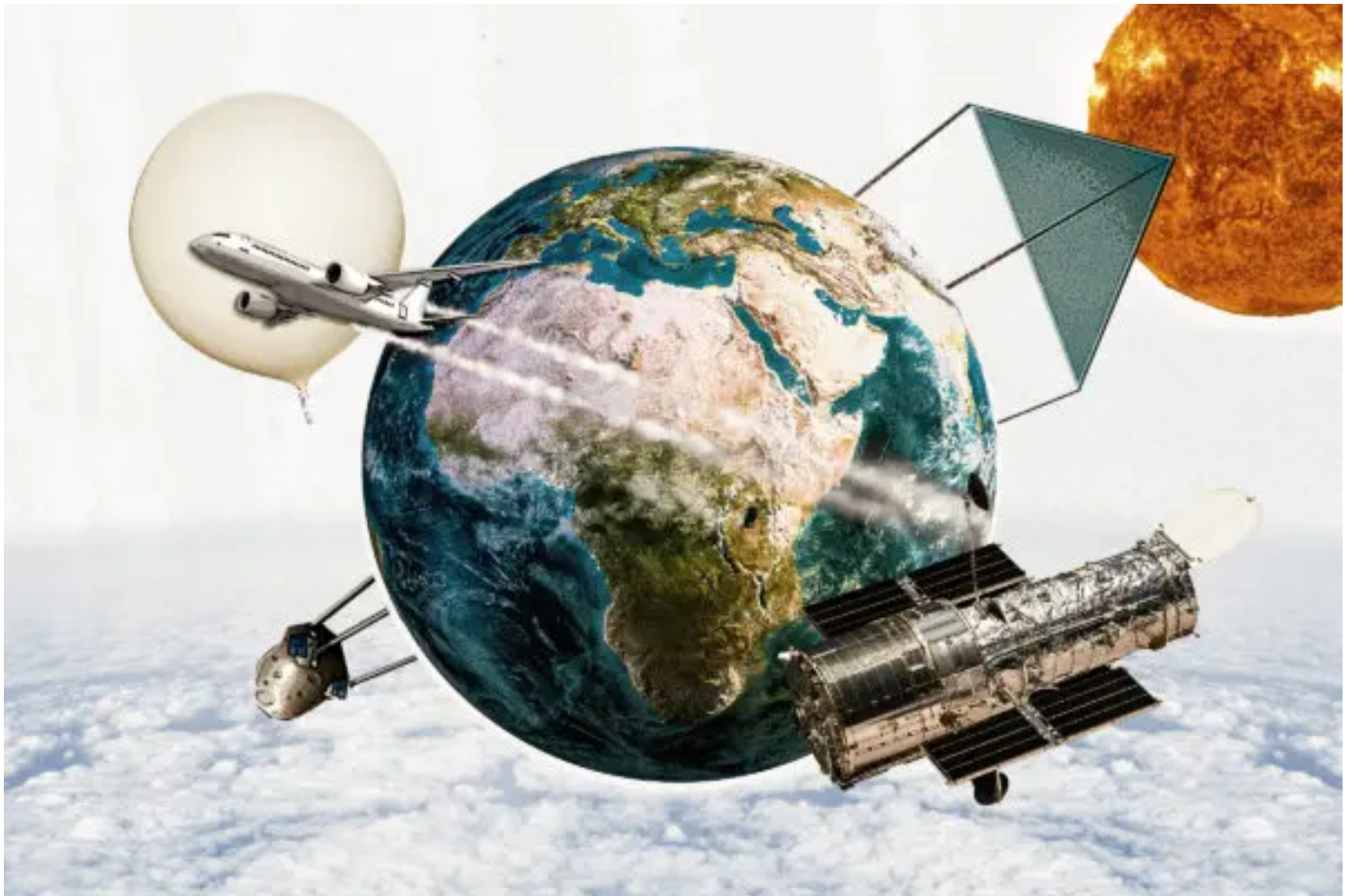
Drastic and Irreversible Climate Geoengineering Worries Scientists