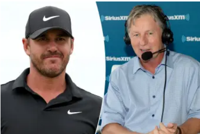
Brooks Koepka buries analyst with 4 words after LIV Golf-PGA Tour merger