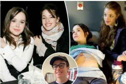
Elliot Page claims he had sex with 'Juno' co-star Olivia Thirlby 'all the time' while filming